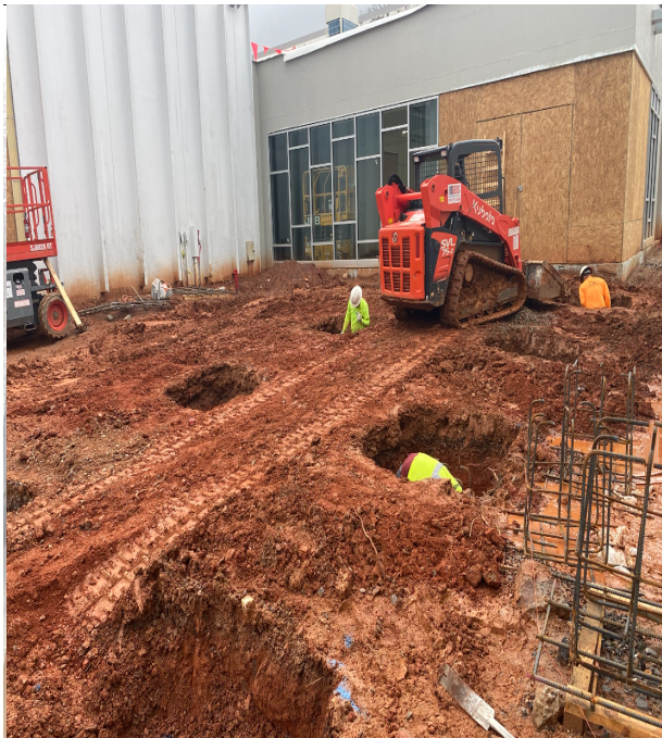
Continue to prep canopy footings a vestibule entry for pour back