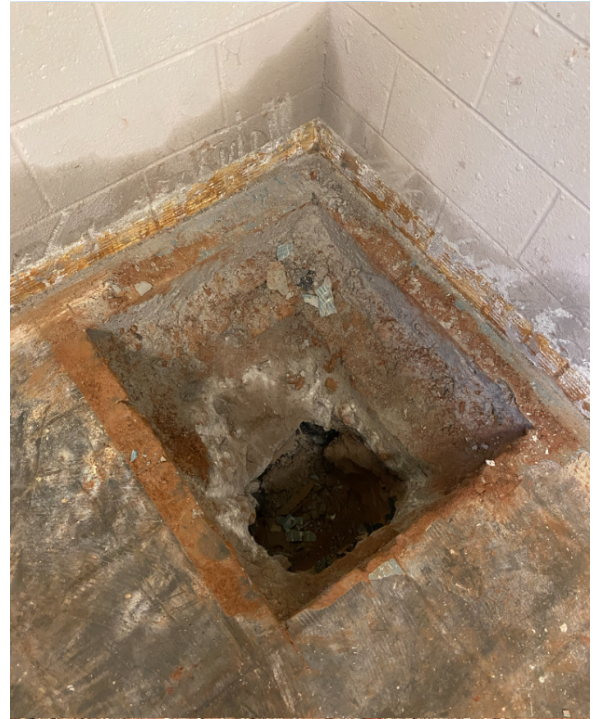
Complete demo for new Fire Riser